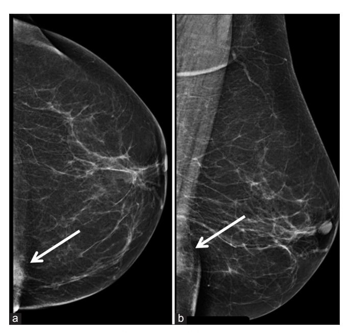
Figure 1: A 62-year-old woman with breast cysticercosis presented with a painful breast mass. (a) Craniocaudal, and (b) mediolateral oblique view of the left breast shows an irregularly shaped high-density mass without calcification at 9 o'clock position in the posterior third of the left breast (shown by the white arrows in a and b).

Cysticercosis usually involves the central nervous system, ocular, muscular, and subcutaneous tissues.<sup>[1]</sup> Only a few case reports and a series of breast cysticercosis have been