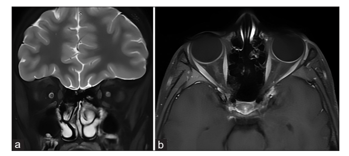
Figure 3: Coronal (a) T2 fat suppressed image and post-contrast axial T1 fat suppressed image (b) show normal bilateral nerves.

cortices.<sup>[4]</sup> Isolated LGB involvement causing bilateral vision loss is rare with very few literature available on the topic. First case described in the literature dates back to 1933 by Mackenzie et al. <sup>[5]</sup> where LGB involvement was attributed to anterior choroidal syphilitic arteritis. While the most recently described case involves hemorrhagic infarction of bilateral LGBs in a patient of acute infective systemic illness with renal and hepatic dysfunction.<sup>[6]</sup>