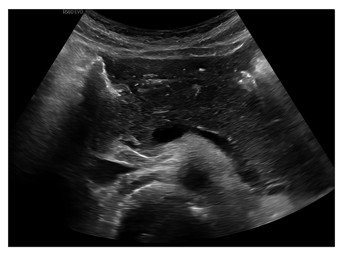
Figure 1: Ultrasound image shows diffusely bulky hypoechoic pancreas. No evidence of any pancreatic or peripancreatic collection seen.

Acute bilateral vision loss is infrequently encountered in children and can be due toretinal detachment, ischemic optic neuropathies, posterior cerebrovascular accidents involving optic radiations, primary visual cortex, and associated visual