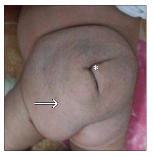
Figure 1: A large well defined skin covered mass seen in lower back region (arrow) with a skin pit (*).

A large subcutaneous lipomatous mass was noted in the back at the level of defect, which was herniating through the bony defect into spinal canal. Spinal cord was low lying and exiting through the defect at L5–S1 level, along with CSF,