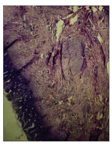
Figure 3: Microscopic slide from histopathology of the mass confirming teratoma (Hematoxylin & Eosin stain, 20X).

at the cervical level. The airway was distal to the obstruction by the mass and appeared mildly dilated. The fetal lungs were hyperexpanded and hyperechoic symmetrically with flattening of the diaphragm. This appearance was classic of congenital high airway obstruction syndrome (CHAOS). Associated with CHAOS, fetal ascites were also observed, indicating evolving hydrops. Moderate polyhydramnios was noted.