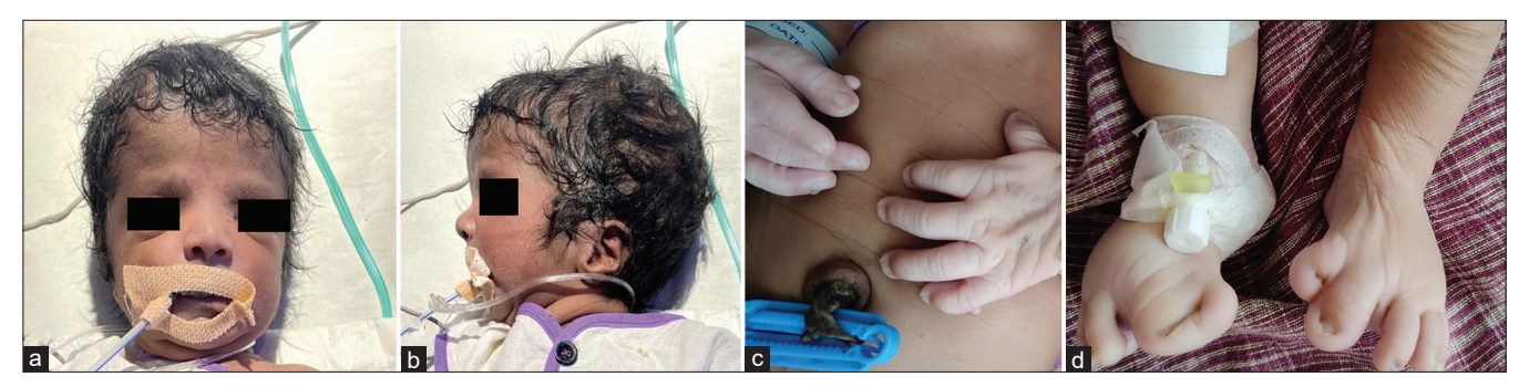
Figure 1: Photographs of patient show (a) hypertelorism and flat nasal bridge, (b) lateral profile shows low set ears, (c) hands show post-axial polydactyly in right hand and pre-axial polydactyly in left hand, and, (d) polysyndactyly in the right hallux and post axial polydactyly in left foot.