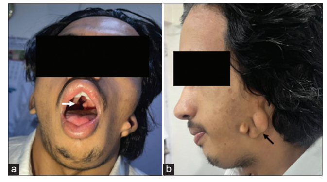
Figure 1: Frontal photograph (a) shows facial asymmetry with flattening of the left side and cleft palate (white arrow). Lateral photograph (b) shows the low set, rudimentary left pinna (black arrow).

High-resolution CT of the temporal bones was also performed, revealing microtia on the left side with the absence of external auditory meatus and canal. The left middle ear cavity was atretic with non-visualization of ossicles. The inner ear structures appear normal. Nonpneumatization of the left mastoid air cells was also noted. The right pinna, external auditory meatus and canal, and the right middle ear cavity and inner ear cavity