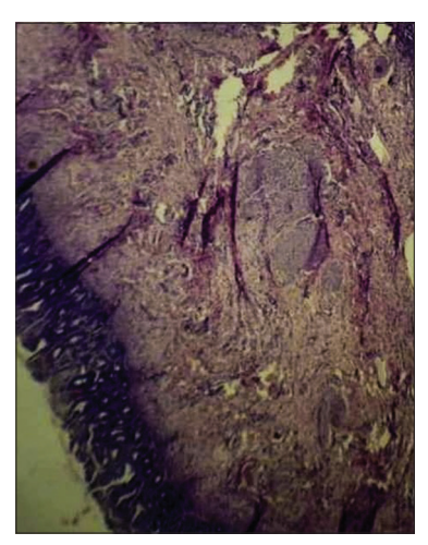
Figure 3: Microscopic slide from histopathology of the mass confirming teratoma (Hematoxylin & Eosin stain, 20X).

at the cervical level. The airway was distal to the obstruction by the mass and appeared mildly dilated. The fetal lungs were hyperexpanded and hyperechoic symmetrically with flattening of the diaphragm. This appearance was classic of congenital high airway obstruction syndrome (CHAOS). Associated with CHAOS, fetal ascites were also observed, indicating evolving hydrops. Moderate polyhydramnios was noted.