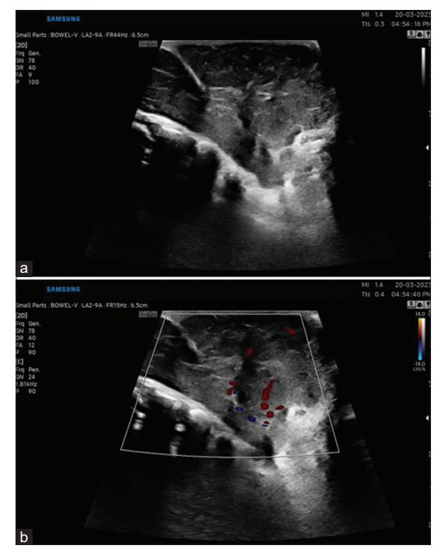
Figure 2: (a) Sagittal gray scale ultrasound image showing well-defined heterogeneously hypoechoic lesion subcutaneously in sacrococcygeal region at upper edge of intergluteal cleft (b) lesion demonstrated internal vascularity on color Doppler ultrasound.