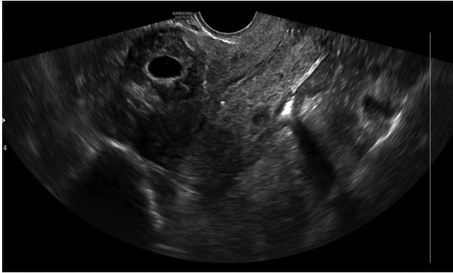
Figure 2: Correlative transvaginal ultrasound image demonstrates right lateral fibroid with cystic changes.