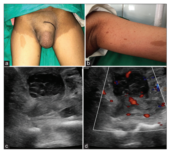
Figure 1: (a-d): The patient presented with a large ill defined hanging left vulval mass, extending from the left inguinal region to the perineum and upto the gluteal region. She had a patch of pigmentation over the bilateral inguinal regions, vulva, and perineum, multiple café-au-lait macules over her neck, arms, buttocks, and thighs, axillary freckling. Ultrasound examination showed an ill defined mixed echogenicity mass, with hypoechoic nodular areas on a hyperechoic background with significant vascularity.

T1WI: T1-weighted image, T2WI: T2-weighted image, MRI: Magnetic resonance imaging, CT: Computed tomography, USG: Ultrasound