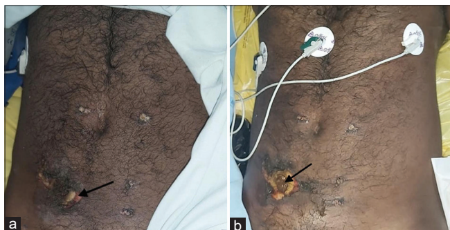
Figure 1: (a) About 45 min after insult, ulcer (black arrow) of size 1 \times 0.5 cm seen in right iliac fossa with surrounding blackish discoloration. (b) About 8 h after the insult, the ulcer increased in size to around 4 \times 3 cm with fecal matter coming out (black arrow).