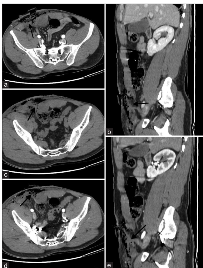
Figure 2: (a and b) Right rectus abdominis defect (black arrow) and defect in skin and subcutaneous tissue with mottled air foci and free fluid in subcutaneous plane seen on (a) Computed tomography (CT) arterial phase axial image (b) CT venous phase sagittal image. (c-e) Prolapse of a segment of the distal ileal loop through rectus defect showing discontinuous wall. (c) CT plain image (d) CT arterial phase axial and (e) sagittal images showing no wall enhancement suggestive of evisceration and perforation of bowel with gangrene.

aspect [Figure 2a and b]. Through the abdominal wall defect, there was prolapse of a segment of the distal ileal loop up