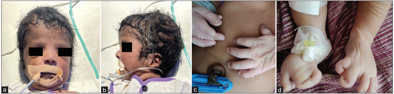
Figure 1: Photographs of patient show (a) hypertelorism and flat nasal bridge, (b) lateral profile shows low set ears, (c) hands show post-axial polydactyly in right hand and pre-axial polydactyly in left hand, and, (d) polysyndactyly in the right hallux and post axial polydactyly in left foot.