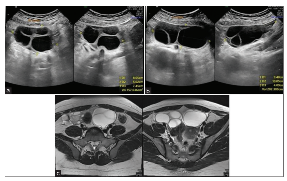
Figure 1: A 19-year-old female presented with ovarian hyperstimulation syndrome who presented with severe abdominal pain (a and b) ultrasound images showing bulky bilateral ovaries with multiple enlarged follicles and (c) axial T2-weighted magnetic resonance imaging section of the pelvis re-demonstrating the ultrasound findings of bulky ovaries with multiple follicles. No e/o torsion was noted.