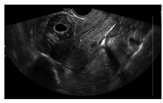
Figure 2: Correlative transvaginal ultrasound image demonstrates right lateral fibroid with cystic changes.