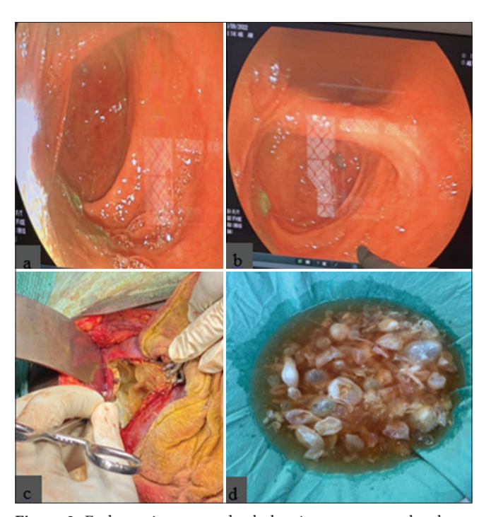
Figure 3: Endoscopic retrograde cholangiopancreatography shows (a and b) daughter cysts in the second part of the duodenum and (c) deroofing, evacuation of cyst content, and (d) removed hydatid cyst during surgery.

Two days after admission, the patient developed jaundice, with clinical findings consistent with obstructive jaundice. The total bilirubin level increased from 0.5 mg/dL to 5.6 mg/dL within 2 days, accompanied by elevated liver enzymes (serum glutamic oxaloacetic transaminase: 108 U/L, serum glutamate pyruvate transaminase: 83 U/L, and alkaline phosphatase [ALP]: 447 U/L). Retrospective history revealed the patient had kept two dogs at home 7-years-ago. An abdominal ultrasound (USG)